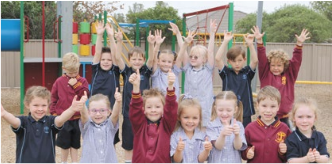
Foundation students at St Mary’s Primary School.