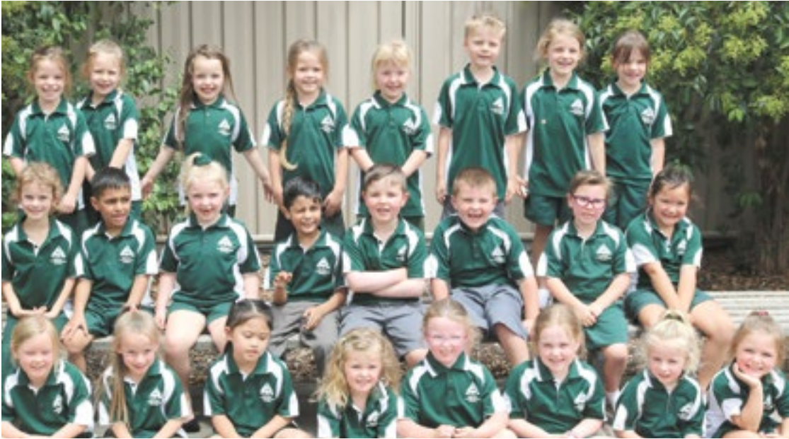
Cohuna Consolidated School Foundation students.

of Cohuna Secondary College says, “It has been great to come back to smiling faces and, I think, a newfound appreciation of what it means to attend school onsite rather than home learning. It has been a great start as we all settle into a close to ‘normal’ routine. We are looking forward to offering a full school program this year; including camps, sporting events and community involvement.”