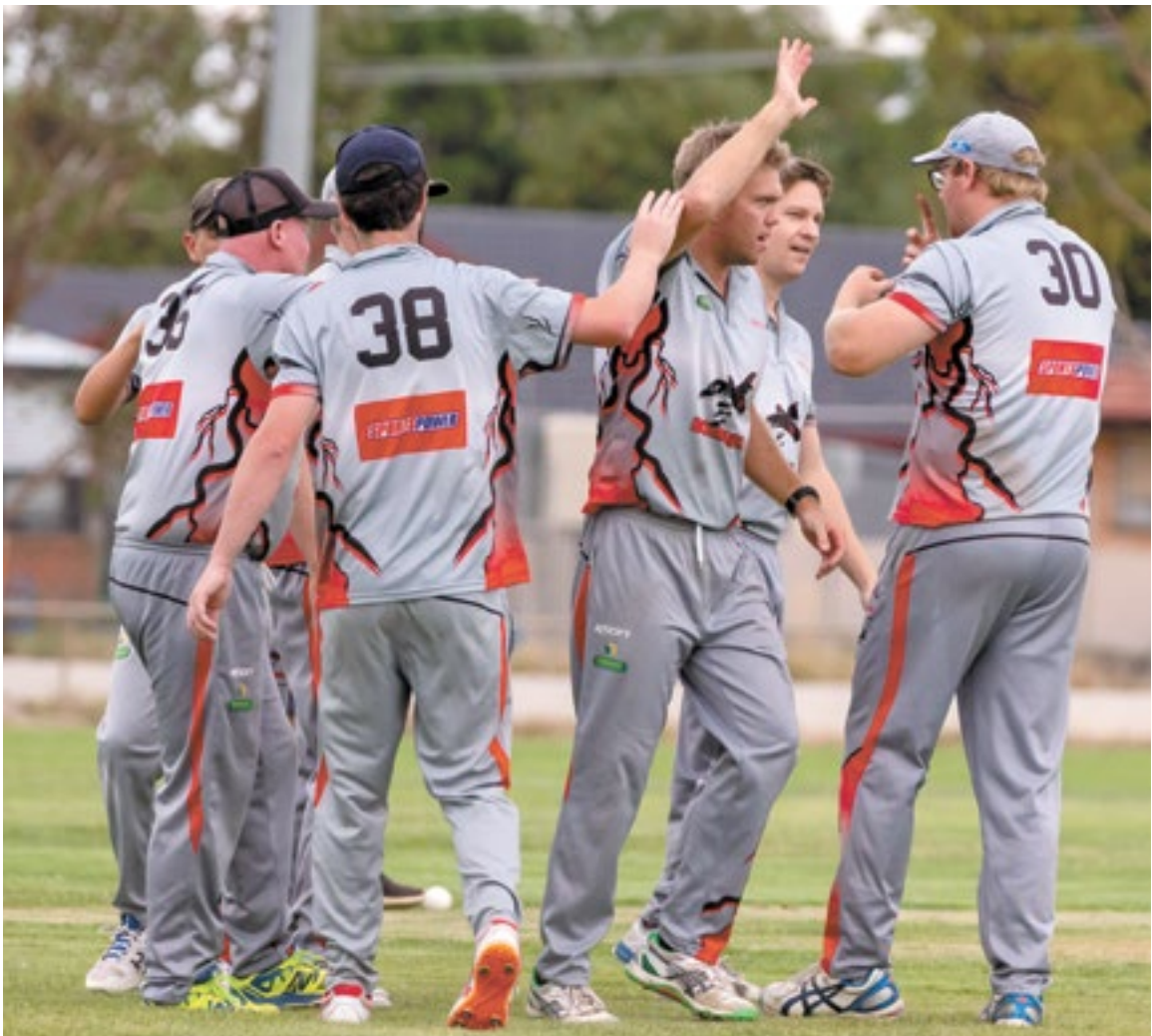
Wandella celebrate a Barham/Koondrook wicket.