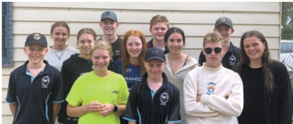
Cohuna Secondary College age group champions.