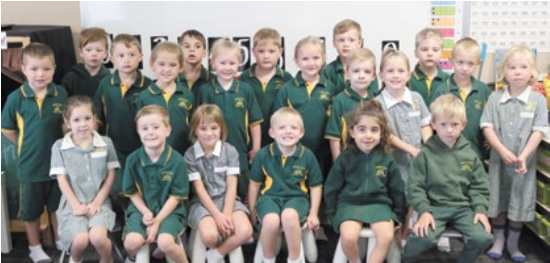
Koondrook Primary School Foundation students for 2021.